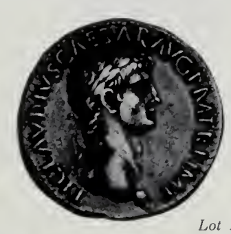
Lot No. 2208

Claudius, 41-54 A.D. Denarius. Rome. Laureate head r. Rv. Pax-Nemesis advancing r. pointing caduceus down at snake; PACI[AVGVSTAE]. Cf. RIC 58. Somewhat ragged edge and slightly off-center, affecting the legends. Extremely Fine with sharp portrait. (1,500-2,000)